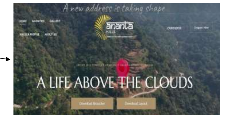
2.5 Kms/10 mins - Plots at INR 65K/Sq/Yard

Dehradun Jolly Grant Airport – 16Km/35 mins