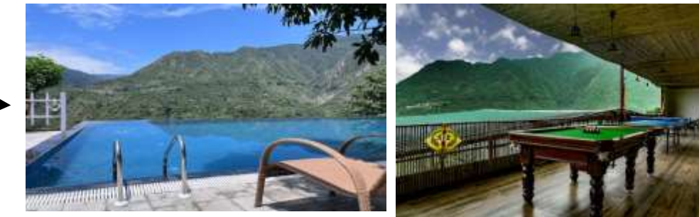
1km/4 mins - Itharna Retreat Resort