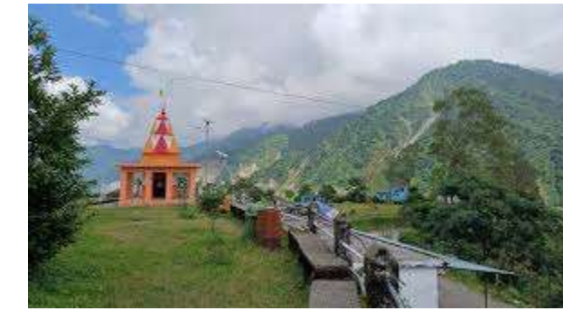
5km/15 mins – Neelkanth Mahadev Temple